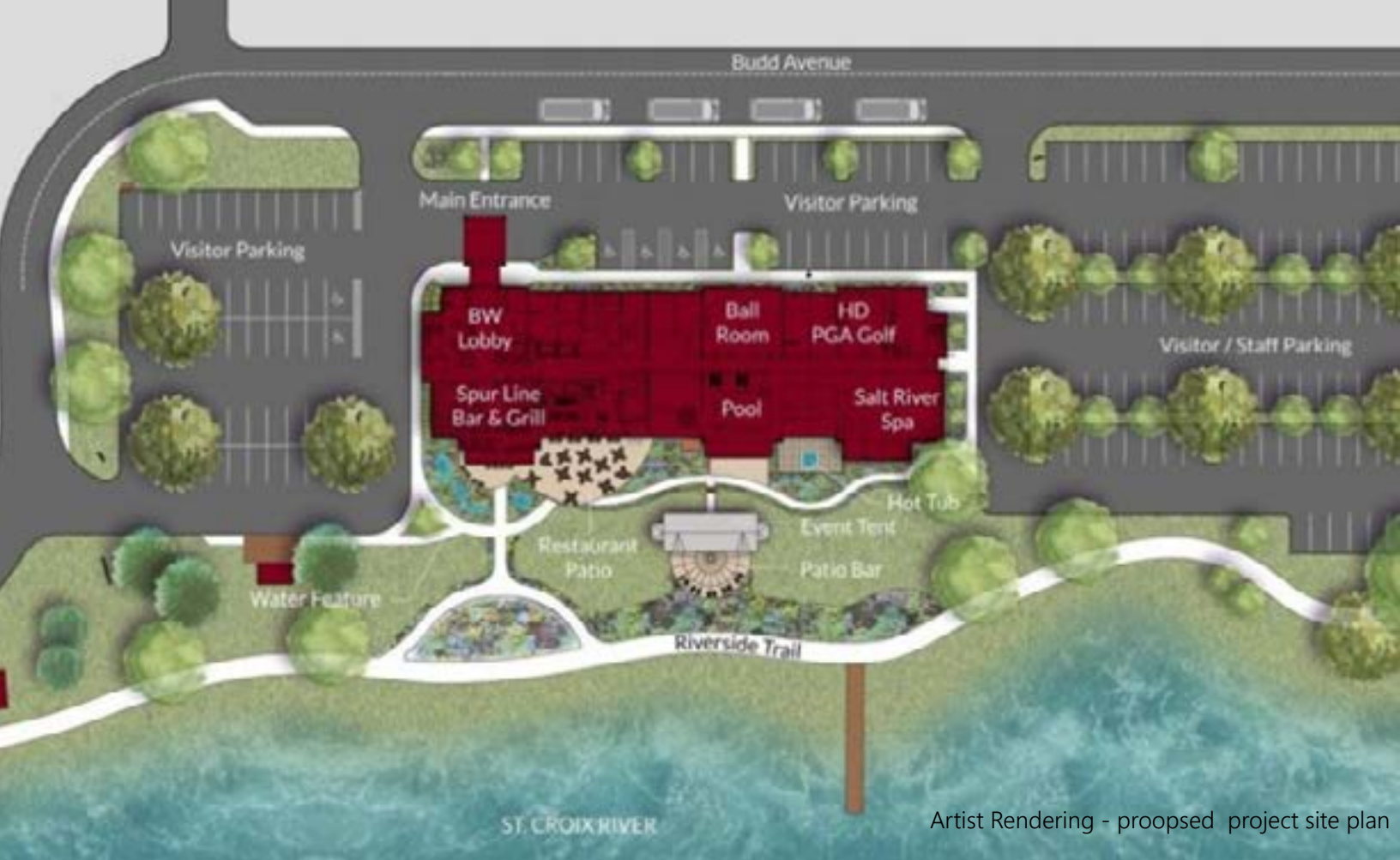
Artist Rendering - proopsed project site plan