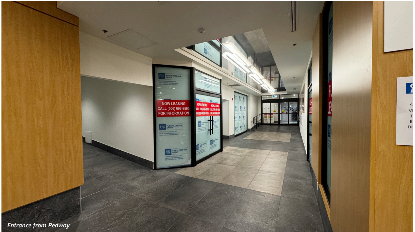
Entrance from Pedway