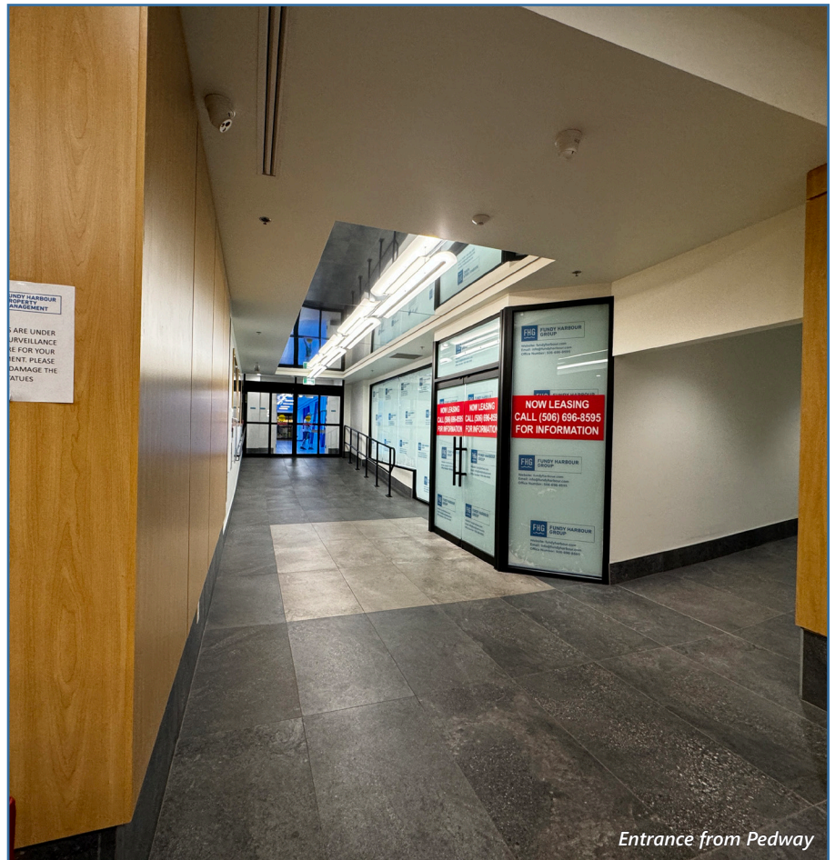
Entrance from Pedway